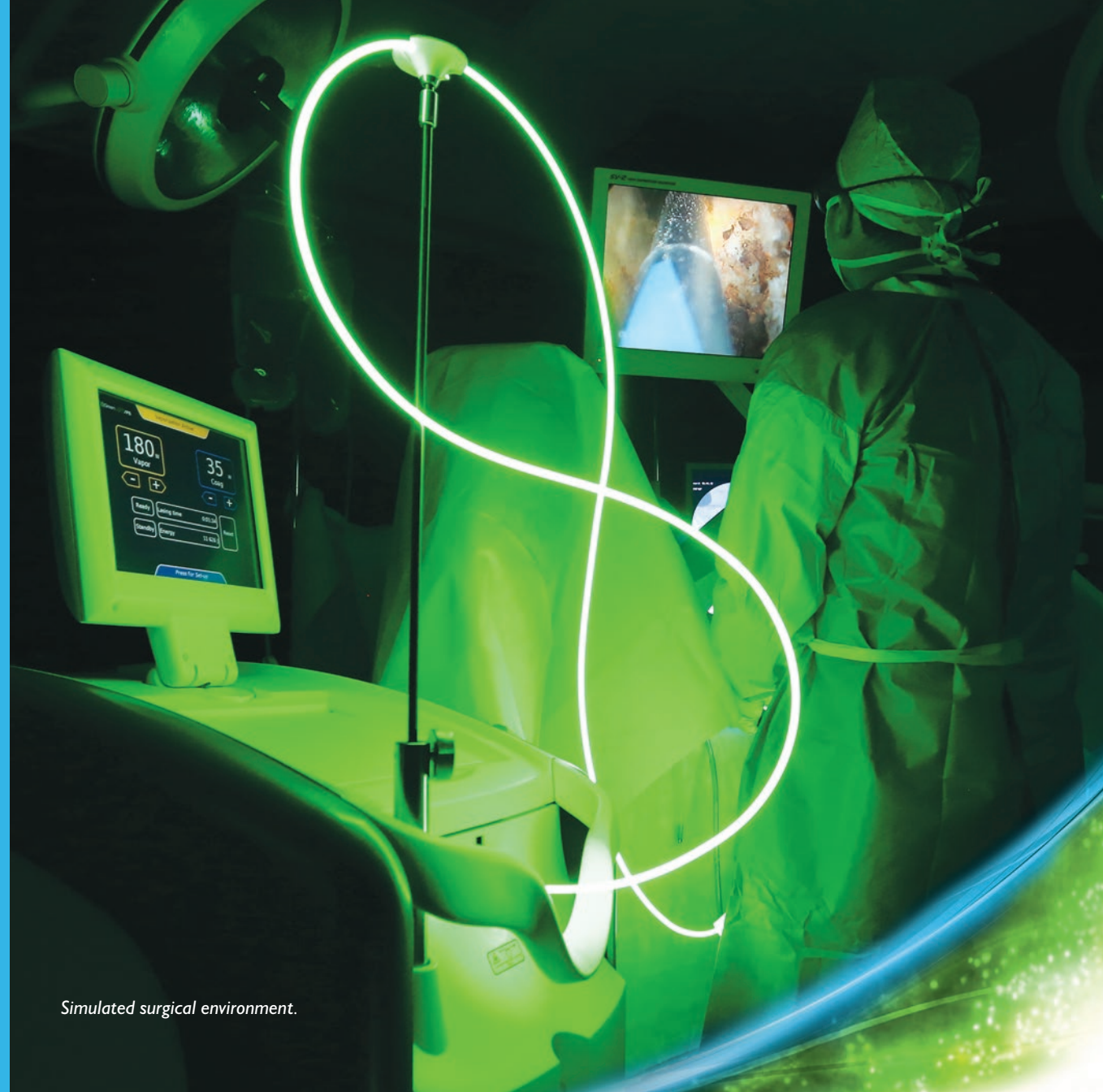
Simulated surgical environment.